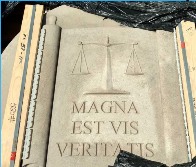
Carved limestone spandrel panel